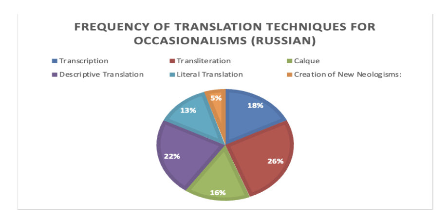
Figure 1. The percentage of the methods of translation occasionalism by J.K. Rowling into the Russian language

This study analyzed 100 neologisms from J.K. Rowling's "Harry Potter and the Philosopher's Stone" and their translations into Russian and Kazakh. The analysis identified distinct patterns in the application of various translation techniques, which are summarized in the following figures: