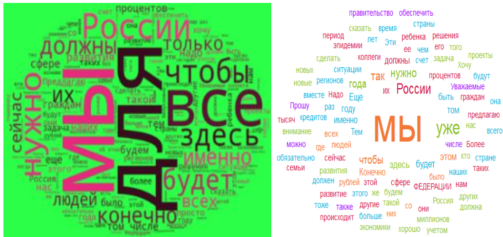
Figure 2. Semantic cloud of V.V. Putin's Message