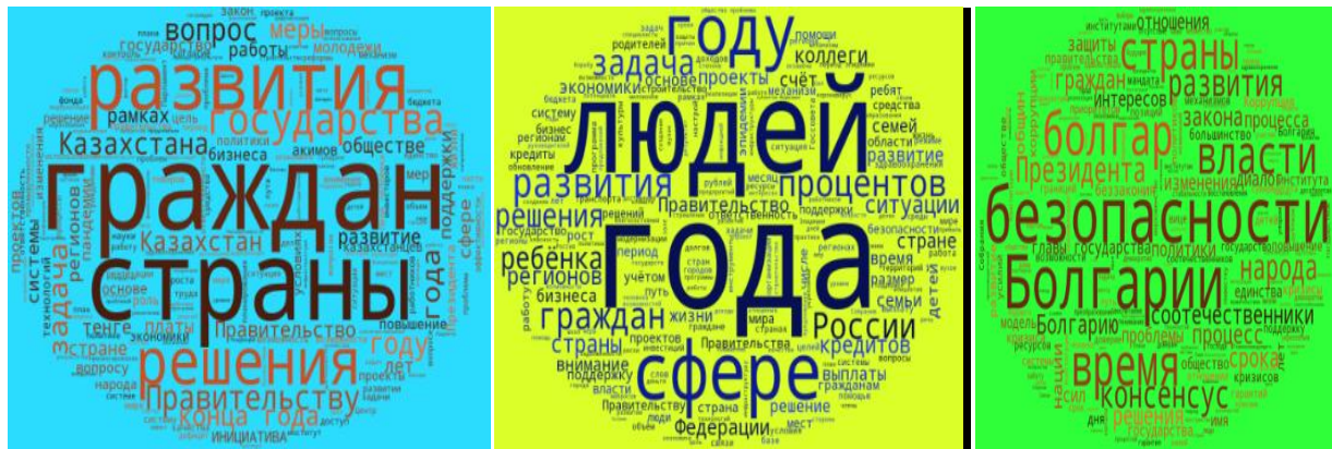
Figures 4–6. List of frequent nouns in the Addresses of the Presidents of Kazakhstan, Russia and Bulgaria

The Address of the Heads of States concerns the economy, politics, culture, education, etc. The key lexical units of different speech parts reflect political leaders' focus on specific topics. They represent the main idea of the president's speech. Thus, nouns were selected and presented in semantic clouds (Figures 4–6).